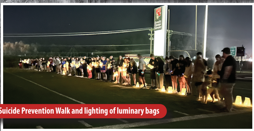
Suicide Prevention Walk and lighting of luminary bags