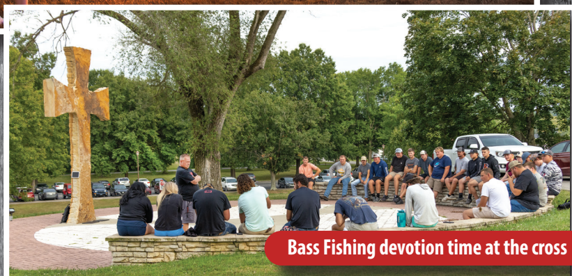
Bass Fishing devotion time at the cross